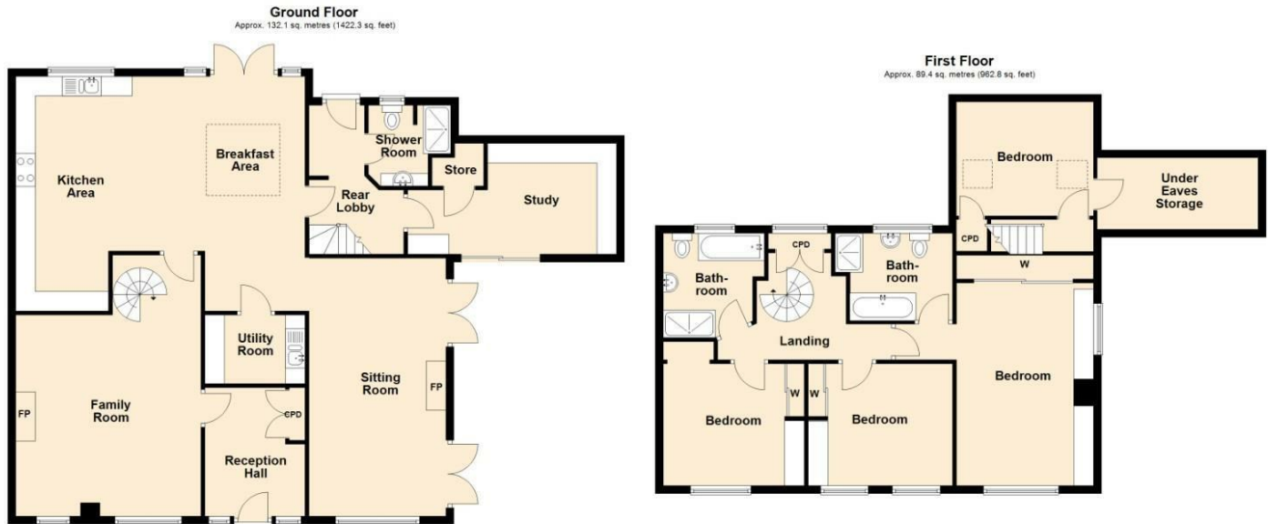
Total area: approx. 221.6 sq. metres (2385.0 sq. feet)